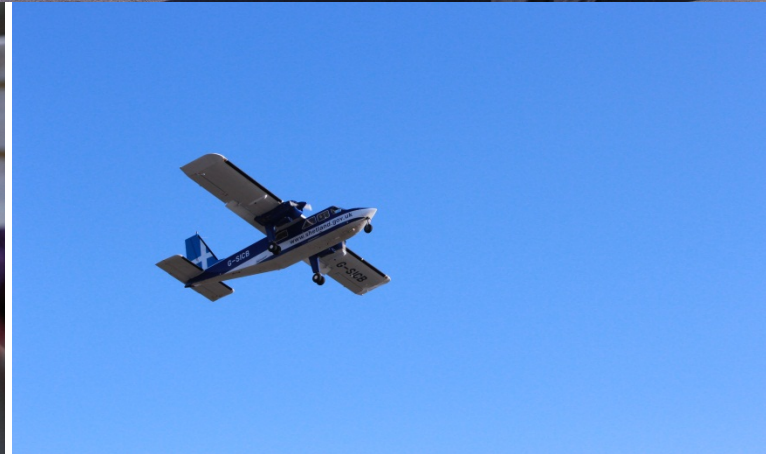
RSNO Visits the Shetland Islands, March 2012