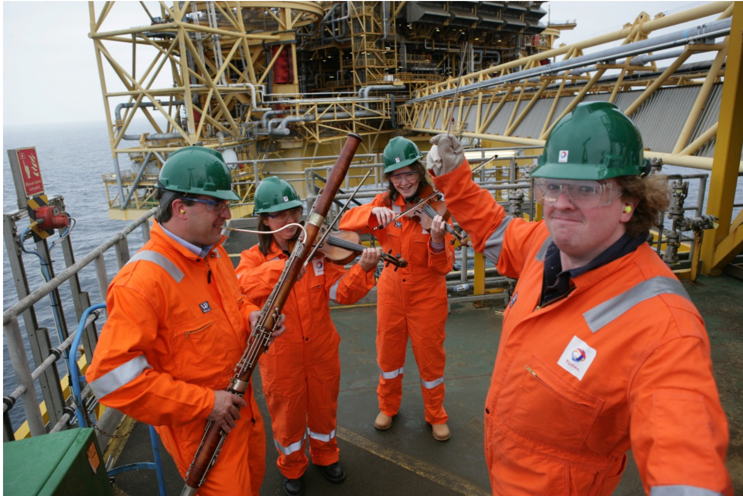
RSNO Concert on an Oil Rig, 2006